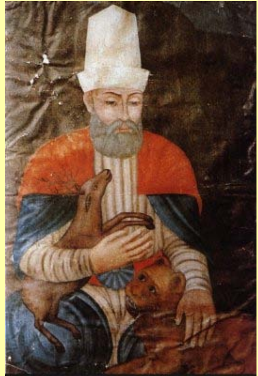
Hajji Bektash Veli